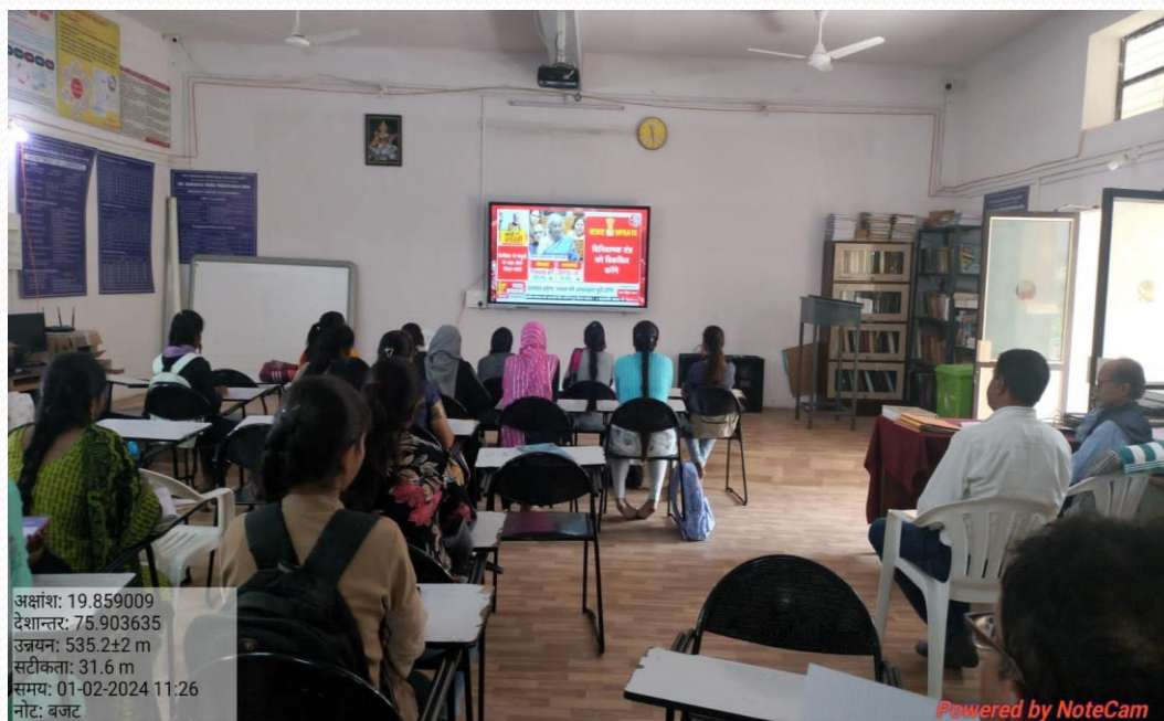
Budget Live Session