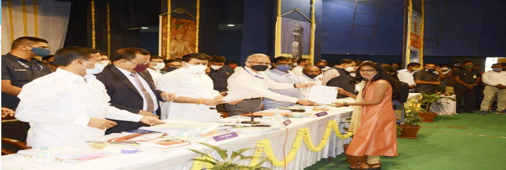
M.Com Merit Ist ( Gold Medal) Honored by Hon. Minister Shree Uday Savant