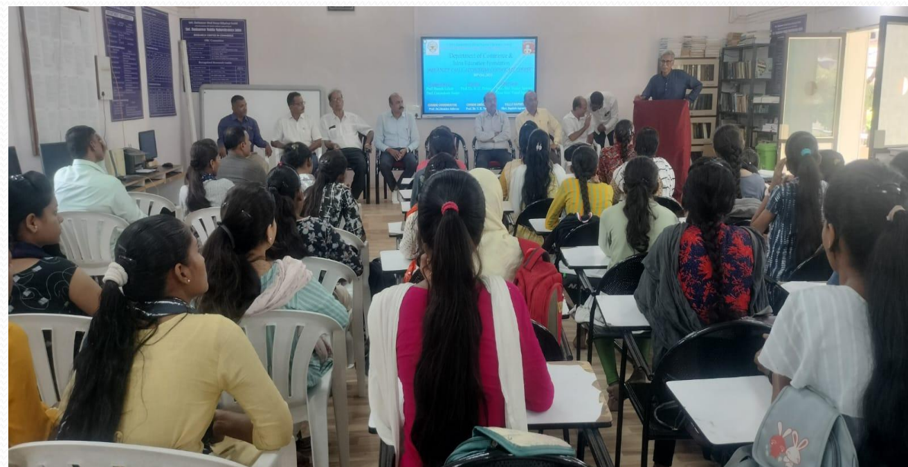
Tally Certificate Course Inuagration